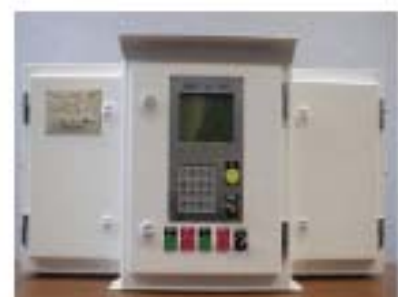
BMAC I.S. PLC