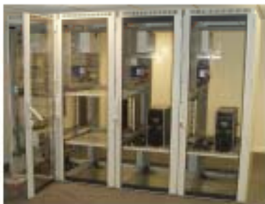
Servers & Surface PLC's