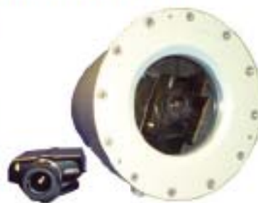
BAF-NET Ethernet Camera