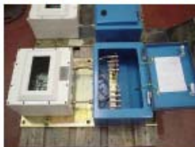
BAF-NET Ethernet Switch