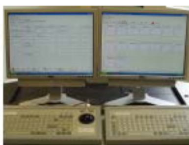
Telephone / Emergency Desk