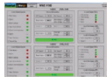
Detail Drive Monitoring