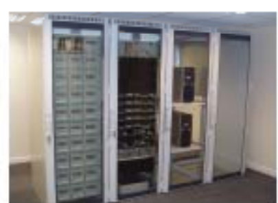
Telephone Emergency Exchange & Barriers